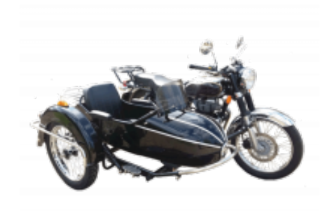
Classic 500 with Sidecar + $0.00