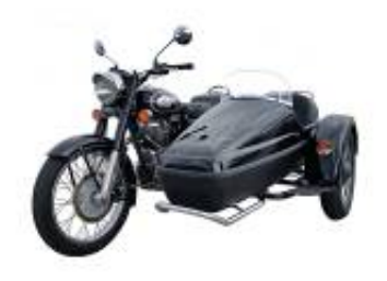
Bullet (with Sidecar) + $0.00