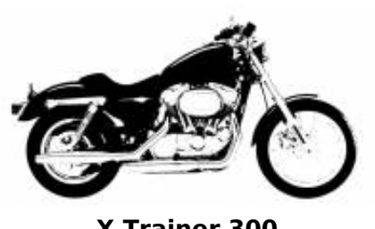
X Trainer 300 + $547.98